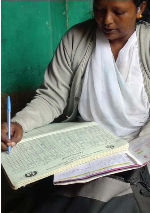
ANM filling out paper registry book.